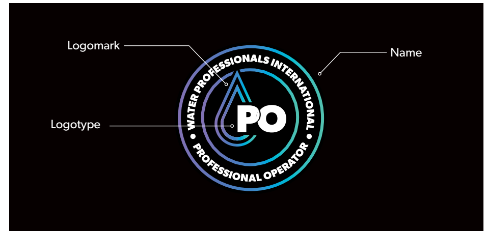
Primary Reverse-Color Version