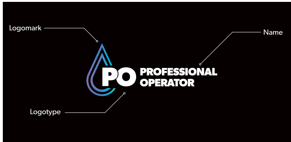
Primary Reverse-Color Version